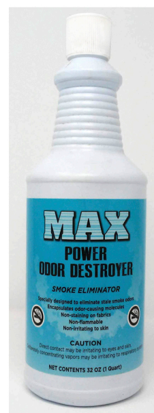
Available in 32 oz. Bottles